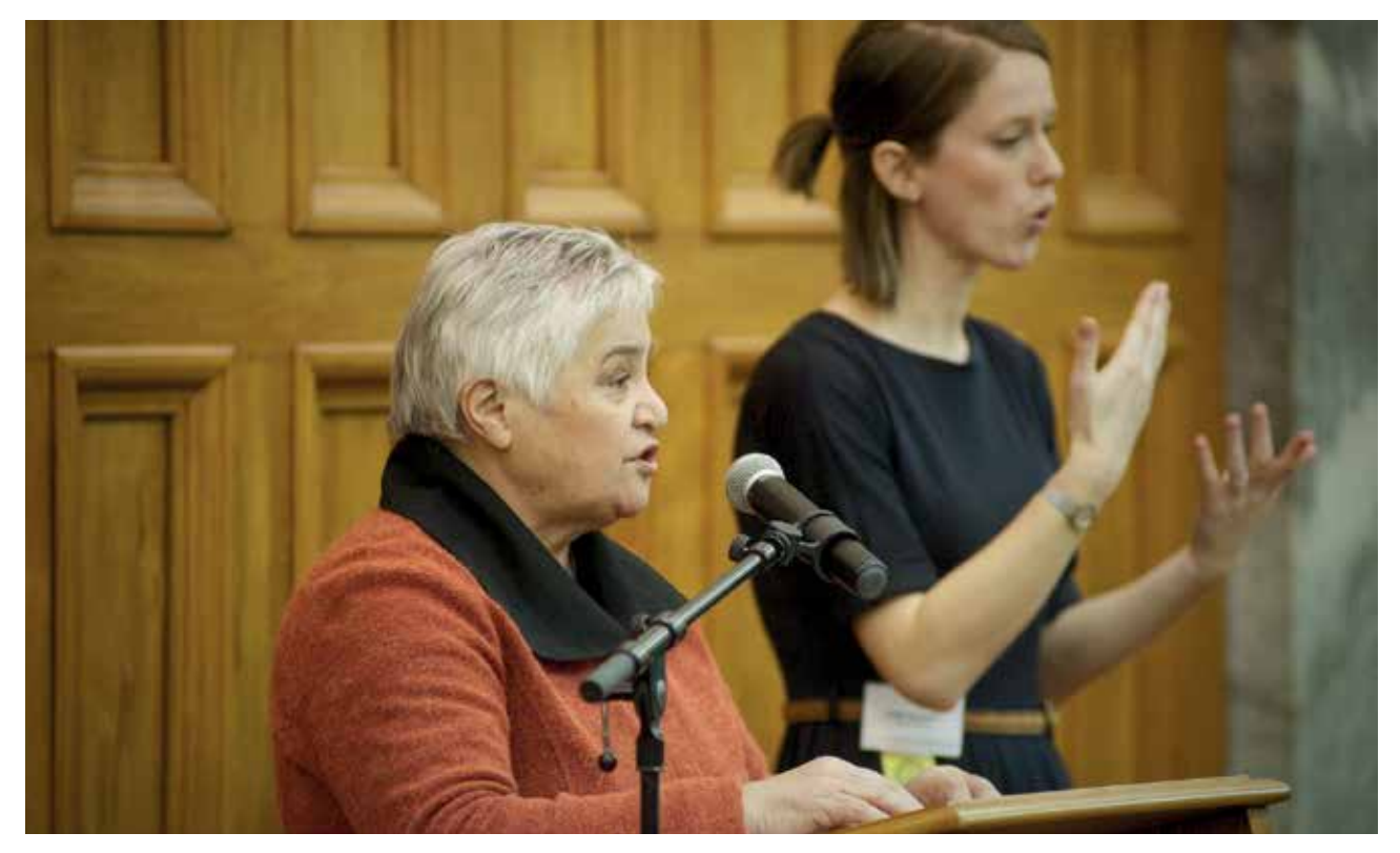
The Hon. Tariana Turia.

3 a person's decision-making skills being seen to be deficient (the functional approach).