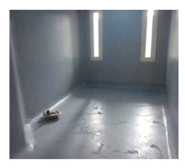
Round room at Mt Eden Corrections Facility.

The Ombudsman's 2012 investigation of prisoner health services suggested there are deficiencies regarding the care of mentally unwell prisoners. Significant unmet needs in prison were reported in terms of common mental health conditions including depression, anxiety, emotional distress and adjustment problems.