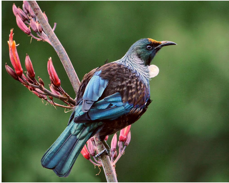
Te Rito o te Harakeke