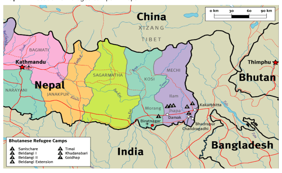
Map A2: Location of refugee camps in Nepal