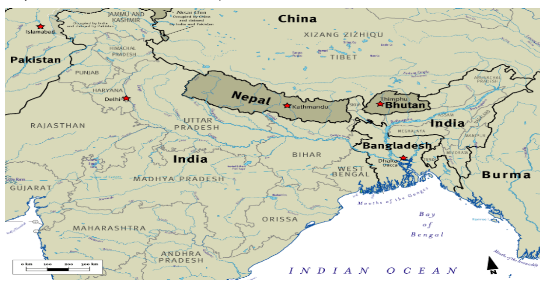
Map A1: Location of Bhutan and Nepal