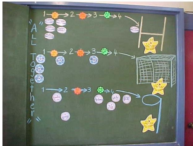
Figure 2 Photo from Haley’s classroom demonstrating student progress

Petra insisted that her students wrote a reflective statement after nearly every PE lesson about what they had learnt and what they still need to learn. These reflections provided her with some evidence of student progress. In addition, teachers had continued to use checklists as a way to collect evidence of students’ movement skill progress.