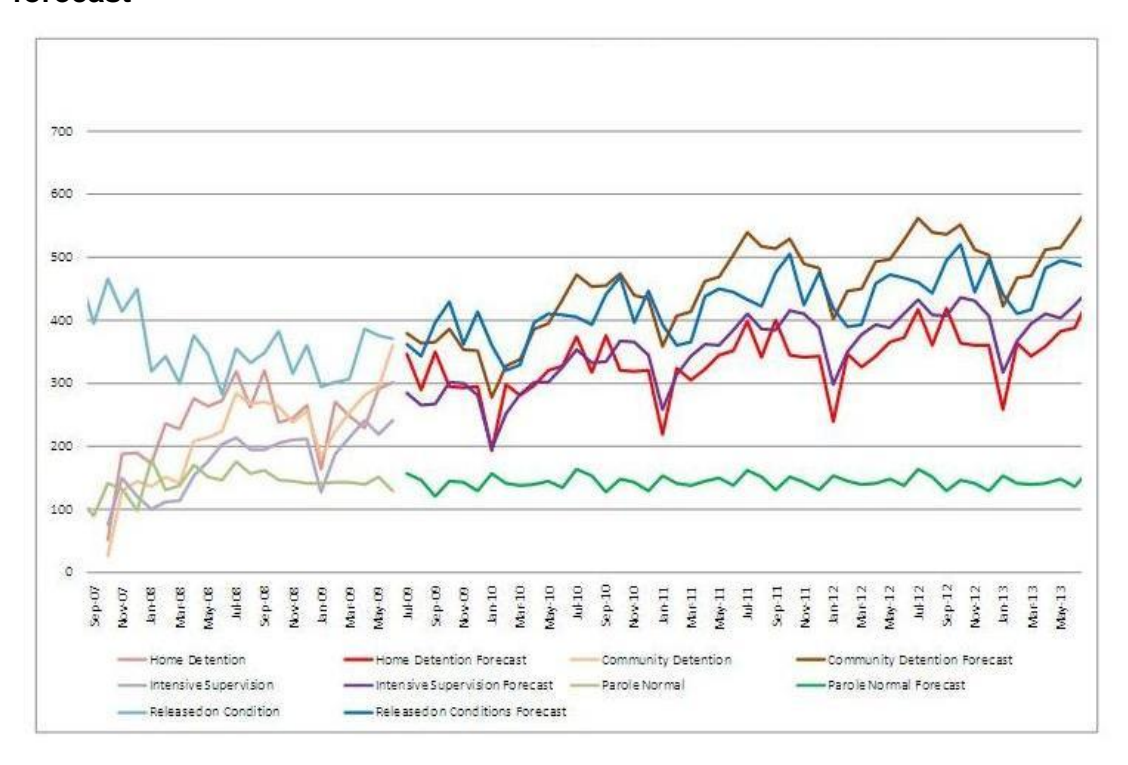
Table 3 gives the number of new starts for sentences overseen by the CPPS for the same quarters as Table 2. Projections for parole and release on conditions,